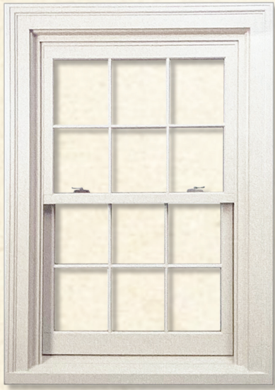
DHC350 (EC300) SHOWN IN BEIGE WITH OPTIONAL 3 1/2" WILLIAMSBURG EXTERIOR CASING, 1 1/4" HISTORIC SILL AND 5/8" SDL GRILLE.